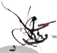
'mini-monsters' Evelyn [2:8]